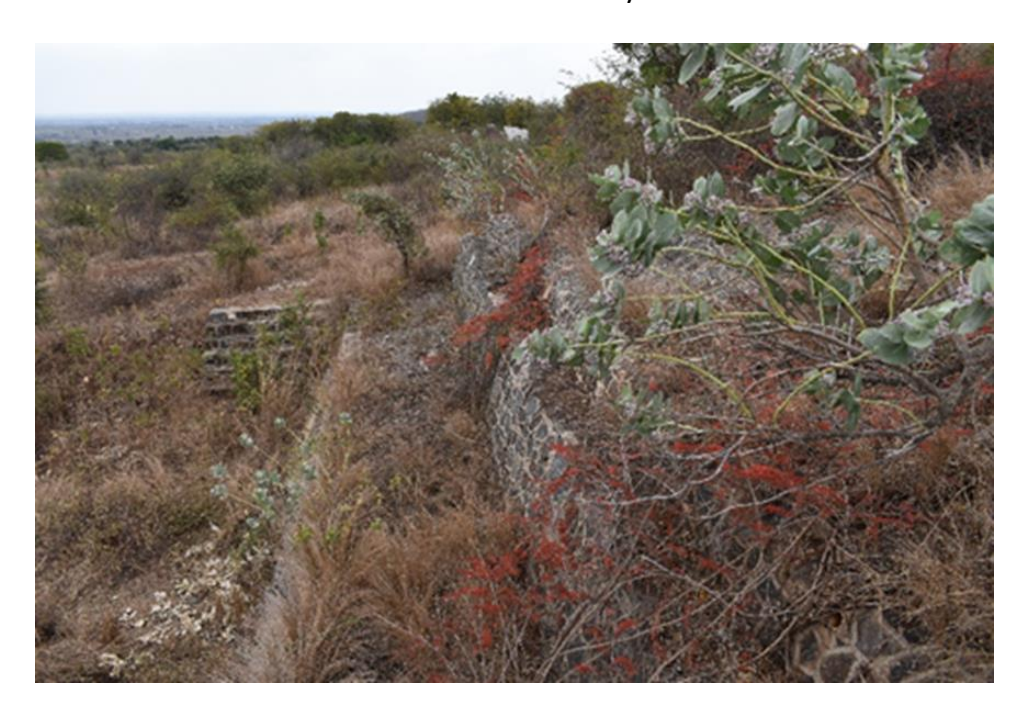
Figure 6: Retaining wall of historic pilot plant crusher

The historic pilot plant crusher wall infrastructure remains in good condition and potentially an area suitable for a plant location. Lindian will clear this area during the upcoming site clearing and fully inspect the infrastructure to determine the suitability to re-use it.