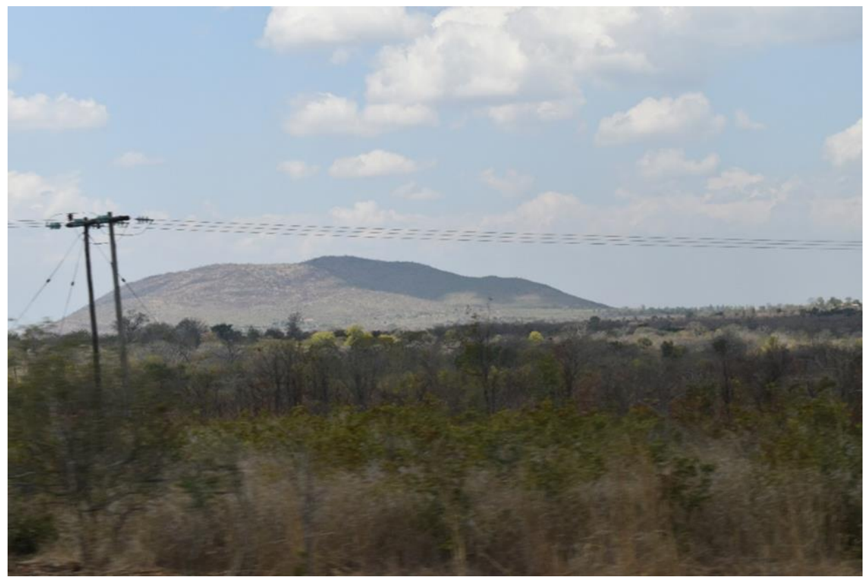
Figure 2: Image of the Kangankunde Hill looking east from the M1 highway.