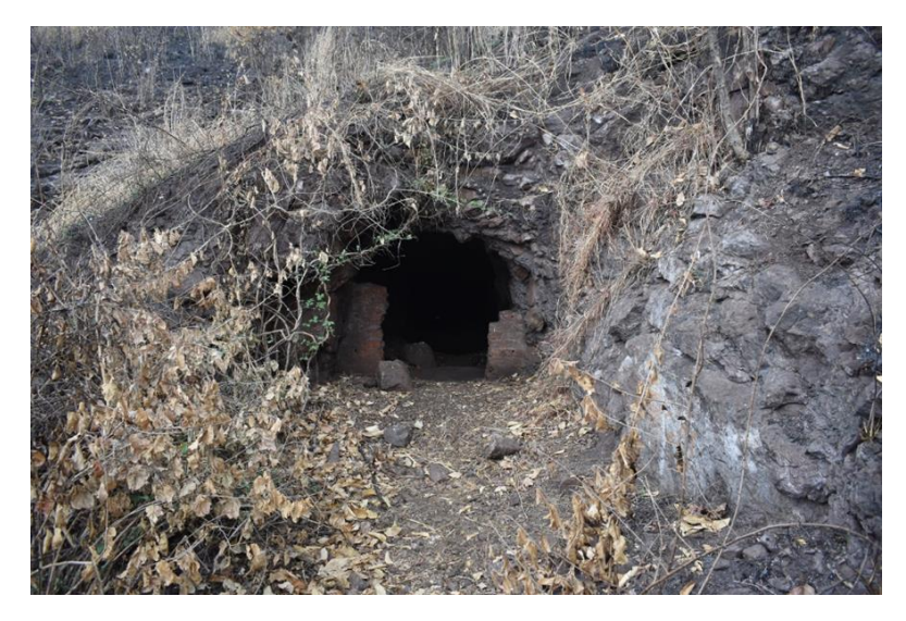
Figure 5: Entrance to historic adit

Lindian has only inspected the entrance of the adit at this stage. Consideration is being given in the work program to re-accessing the adit for bulk sampling and as a potential drill platform to test the lateral extents of the carbonatite where surface access is limited.