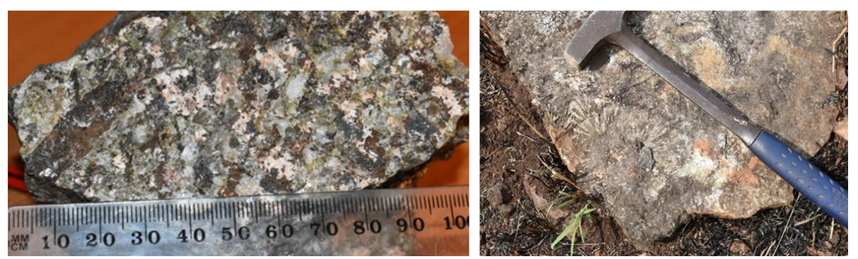
Figure 4: Left; Large crystals of green monazite with associated ankerite (iron carbonate) (brown) and strontianite (pink) in carbonatite, Right Coarse radiating monazite crystals, hammer as scale (42cm long).