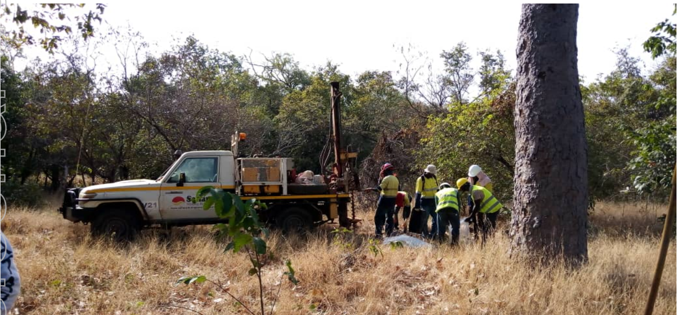
Figure 5: Drill Rig & Crew undertaking Drilling Operations

The drill program has confirmed the presence of very high-grade Conglomerate Bauxite as mapped within the Bouba Plateau.