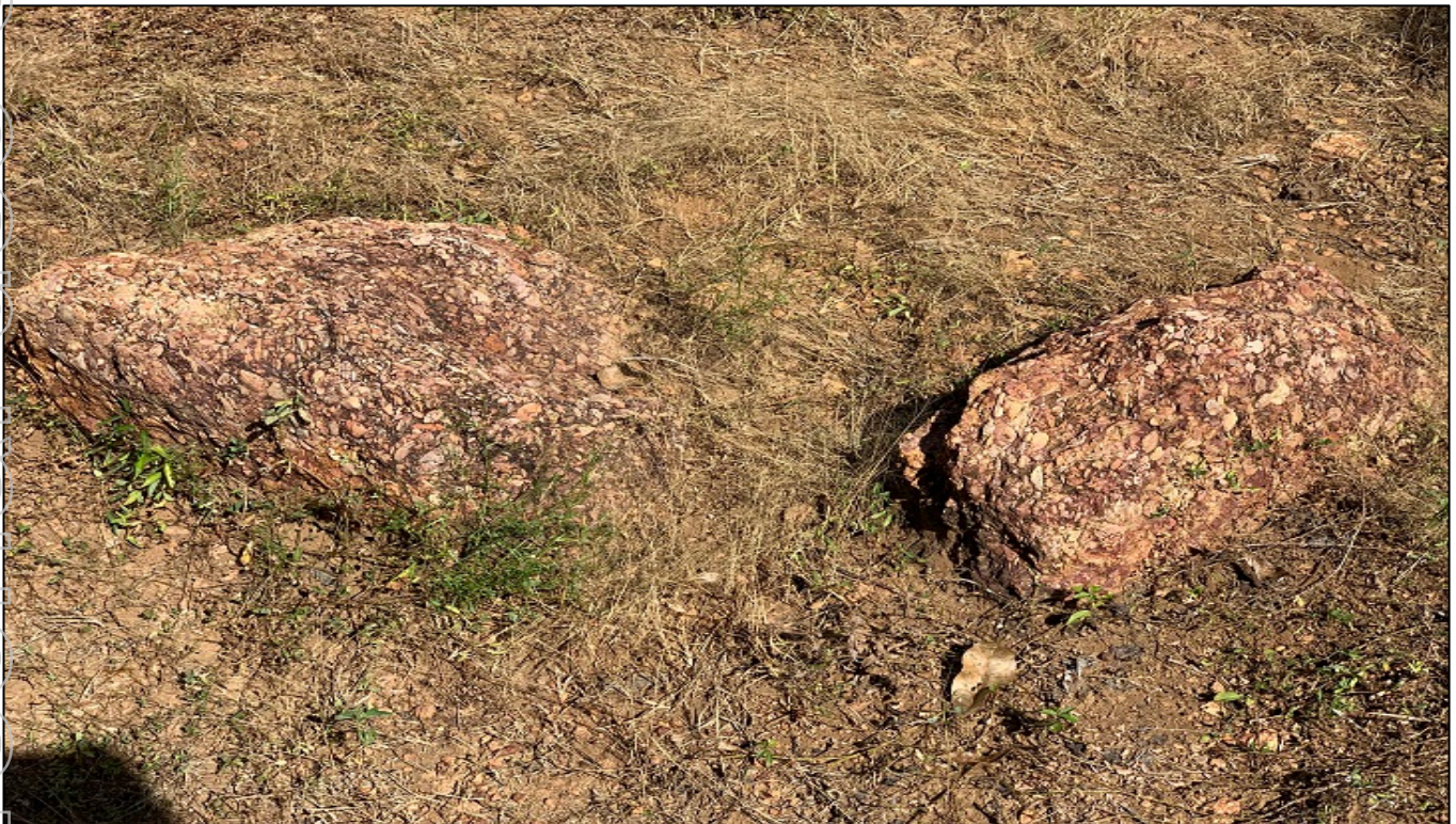
Figure 3: Bouba Conglomerate Bauxite outcropping

Reviewing of the northern edge of the plateau indicated no outcropping basal geology that may reduce the vertical extent of the Conglomerate Bauxite pile, and it also did not indicate a “broken edge” typical of an “in situ” bauxite Plateaux of the region. This highlights the unique geology of this outcropping bauxite pile. Figure 3 below shows the surface outcropping nature of the Conglomerate bauxite.