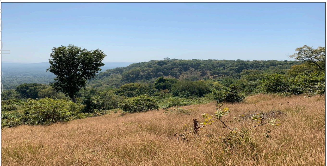
Figure 2: Bouba Conglomerate Bauxite Plateaux

As can be seen in Figure 2 below the Bouba Conglomerate Bauxite Plateaux is not a typical flat, barren Bauxite Plateaux and is characterized by relatively dense growth across a prominent mound.