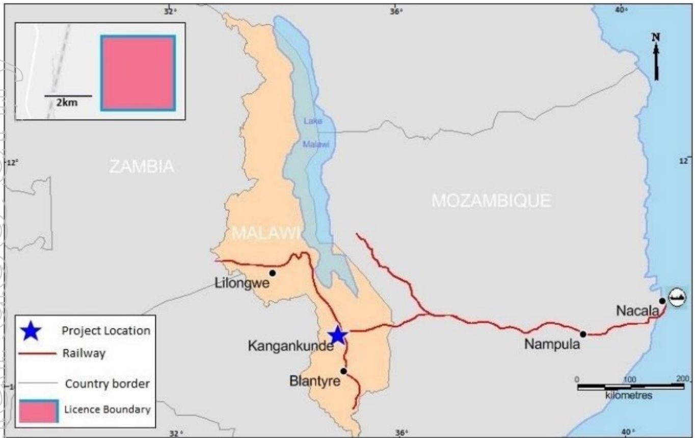
Figure 6. Location of Kangankunde Project showing the location rail and port infrastructure