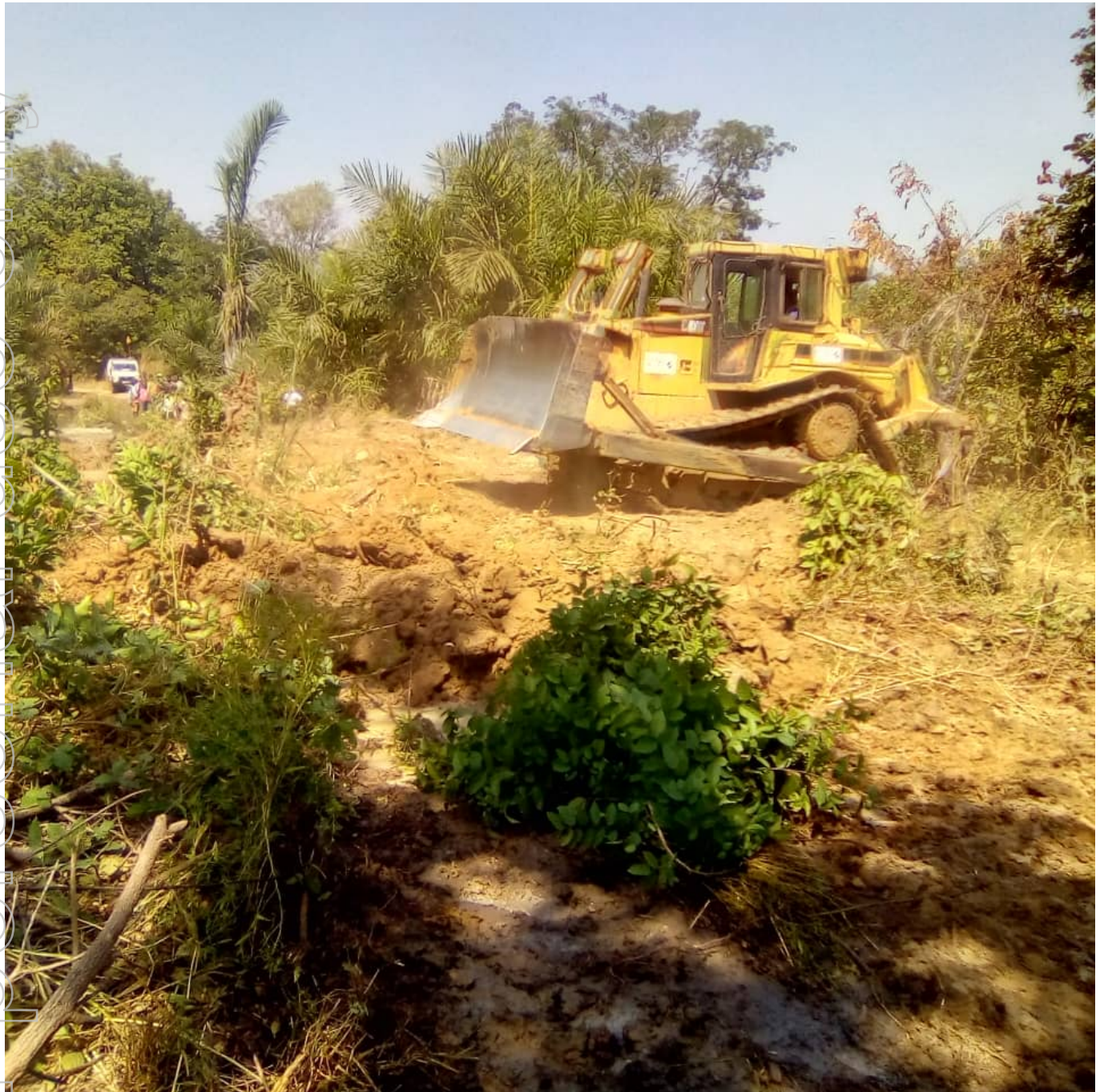
Figure 4: Bulldozer Undertaking Access Track Works

Managing Director Shannon Green Commented: “The commencement of access track and drill site preparation works at site marks a significant milestone in the Company’s progression.