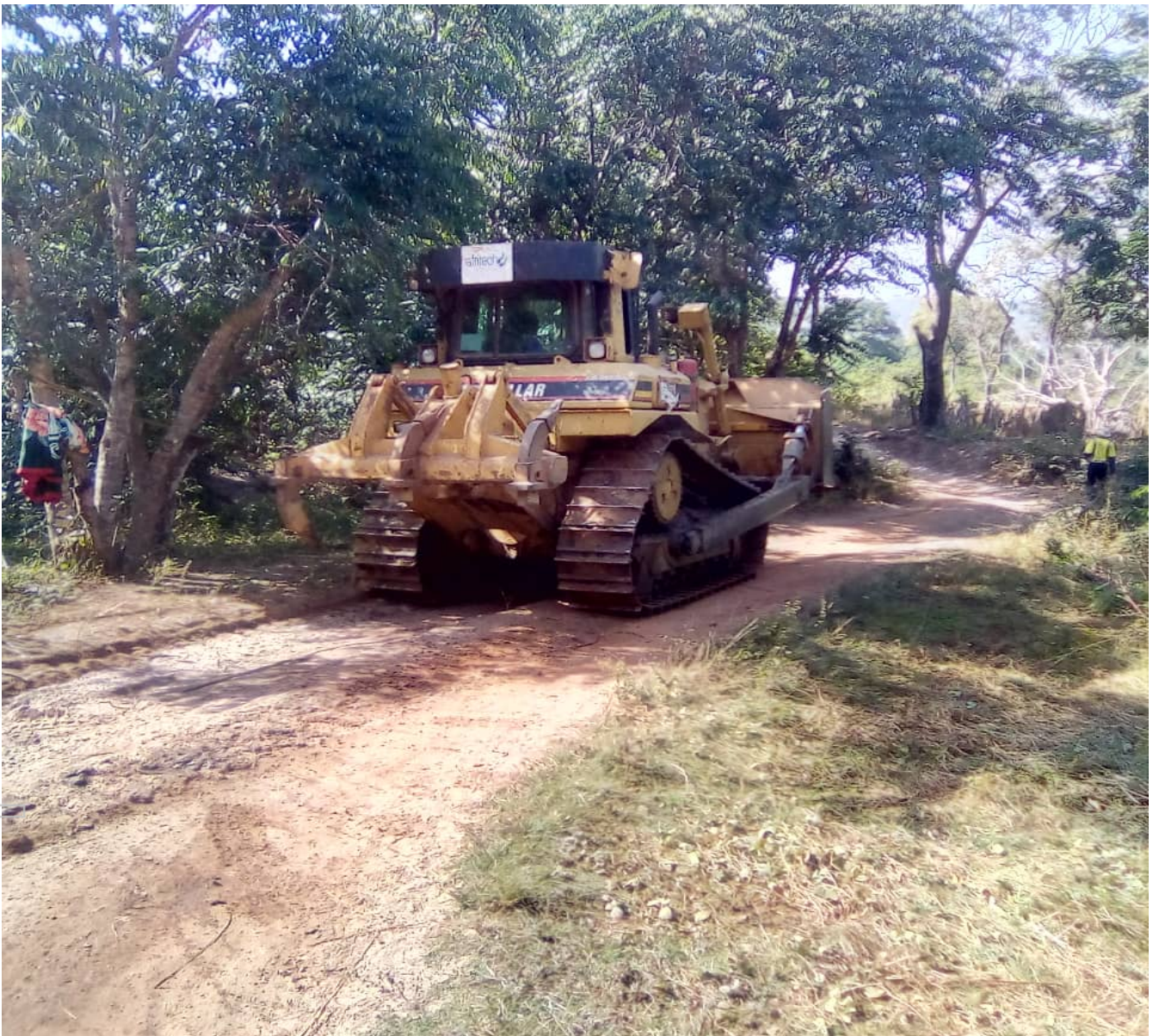
Figure 2: Bulldozer Undertaking Access Track Works

The following Figures 2,3 & 4 are of the contractors Bulldozer Undertaking Access Track Works from Koumbia to site.