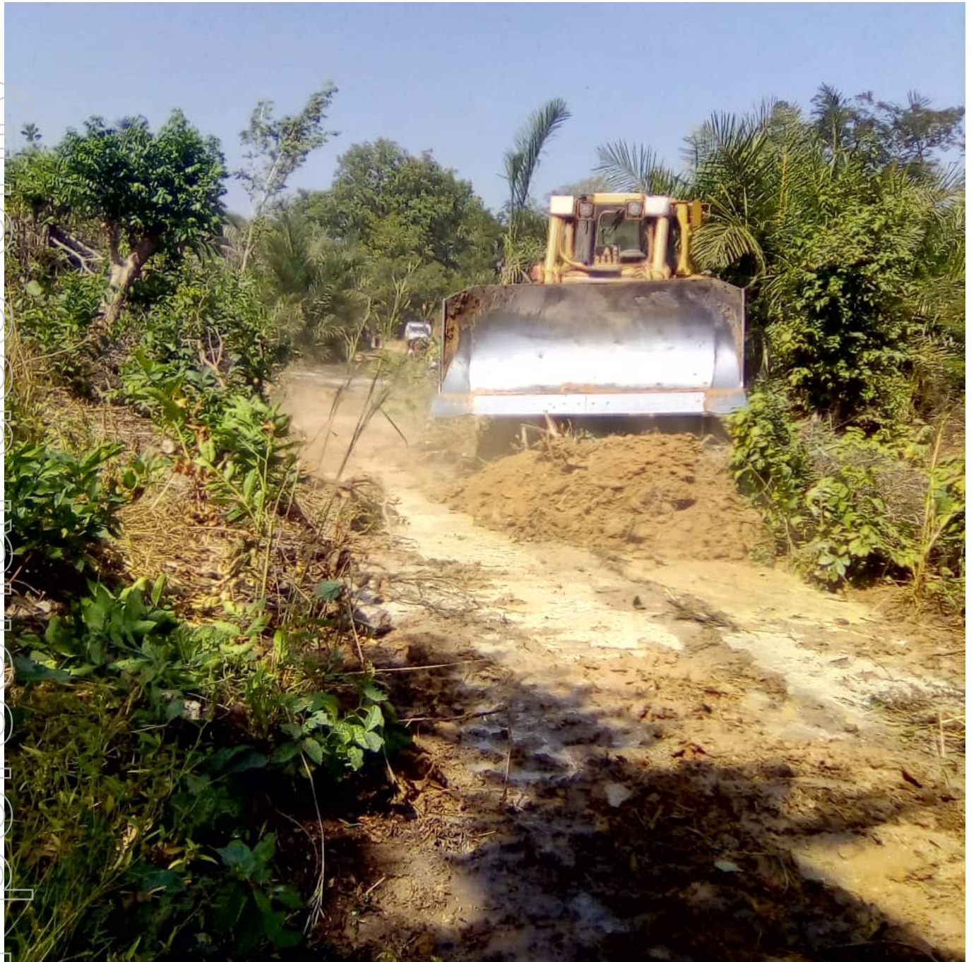
Figure 3: Bulldozer Undertaking Access Track Works