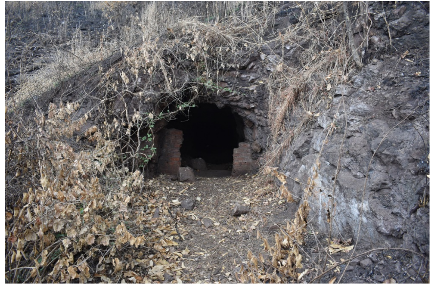
Above: Old underground adit into the north zone of dolomite carbonatite mineralisation. The adit is about 1.5m x 1.5m and extends for about 300m into the hill toward the south.

The site visit included visitation to the old underground workings (the adit entrance) and infrastructure that remained around the mine workings. Mineralisation was seen in the hill side for about 75 metre in width.