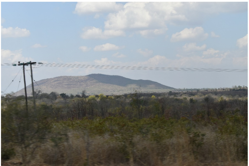
Looking east to Kangankunde from the M1 highway rising 200 metre above the grass terrain – distributor power off the main high voltage transmission line

Kangankunde is located about 100km north of Blantyre. It lies within the Machinga district of Southern Malawi, 14km south of the town of Balaka (population 36,000) and 25 km west of the river town of Liwonde (population 40,000), Malawi.