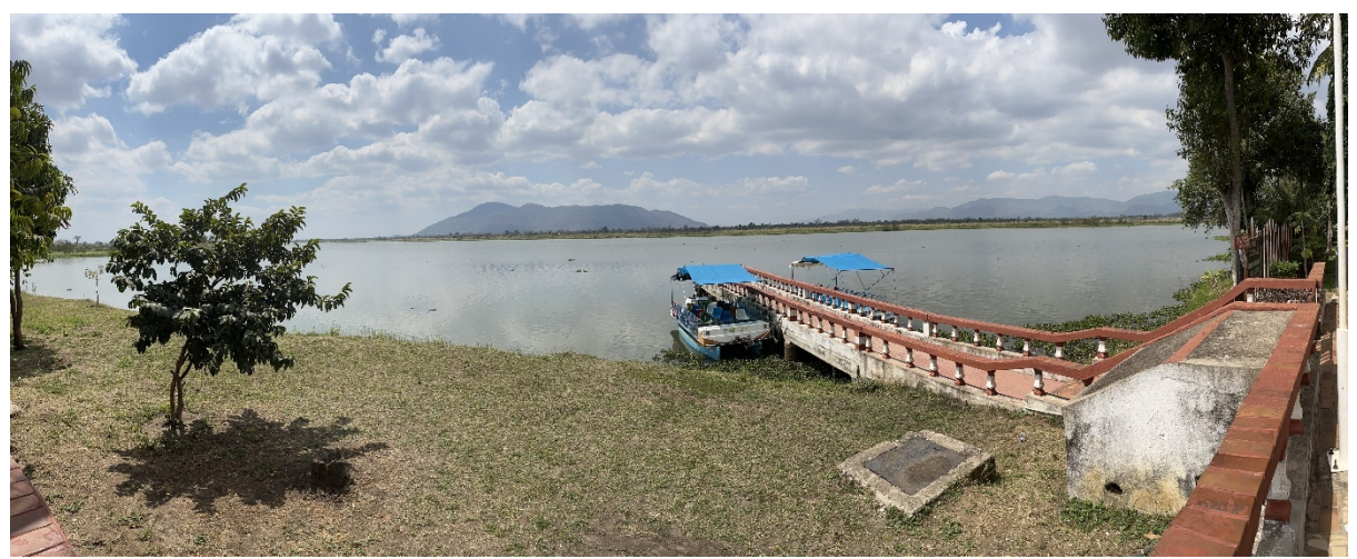
Shire river at Liwonde, Malawi, 25 Km to the east of Kangankunde.

Malawi has eight (8) hydroelectric power generation stations generating a total of 360Mw of power, three (3) planned hydroelectric power generation projects (totalling 720Mw), one thermal 300Mw power station and 150Mw of planned solar power generation.