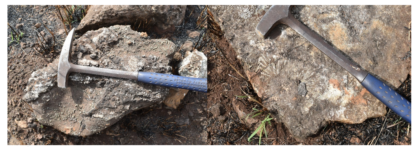
Top left: Lindian Chairman Mr Kabunga with mineralisation near the old plant area at the base of the Kangankunde Hill. Top right: Agglomerate (camera lens cap is 55mm in diameter). Bottom left: large monazite crystals with long handle Estwing hammer as scale (42cm long). Bottom Right: large radial monazite crystal growth about 12cm in diameter.