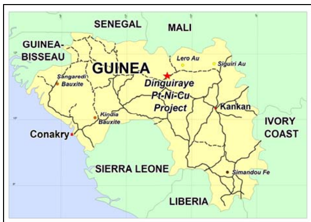
Figure 1 – Location Plan

Lindian Resources Limited (“the Company”) has been granted a second exploration permit covering 311km 2 at the Dinguiraye Pt-Ni-Cu Project located in Guinea, West Africa. This licence is contiguous to the previously granted exploration permit giving the Company a total permit area of 705km 2 . The project is located at the town of Dinguiraye approximately 400km northeast of Conakry in the central part of Guinea. It is readily accessible by the N1 sealed road from Conakry with the final 83km to Dinguiraye on the N30 all weather unsealed road (Figures 1 & 2).