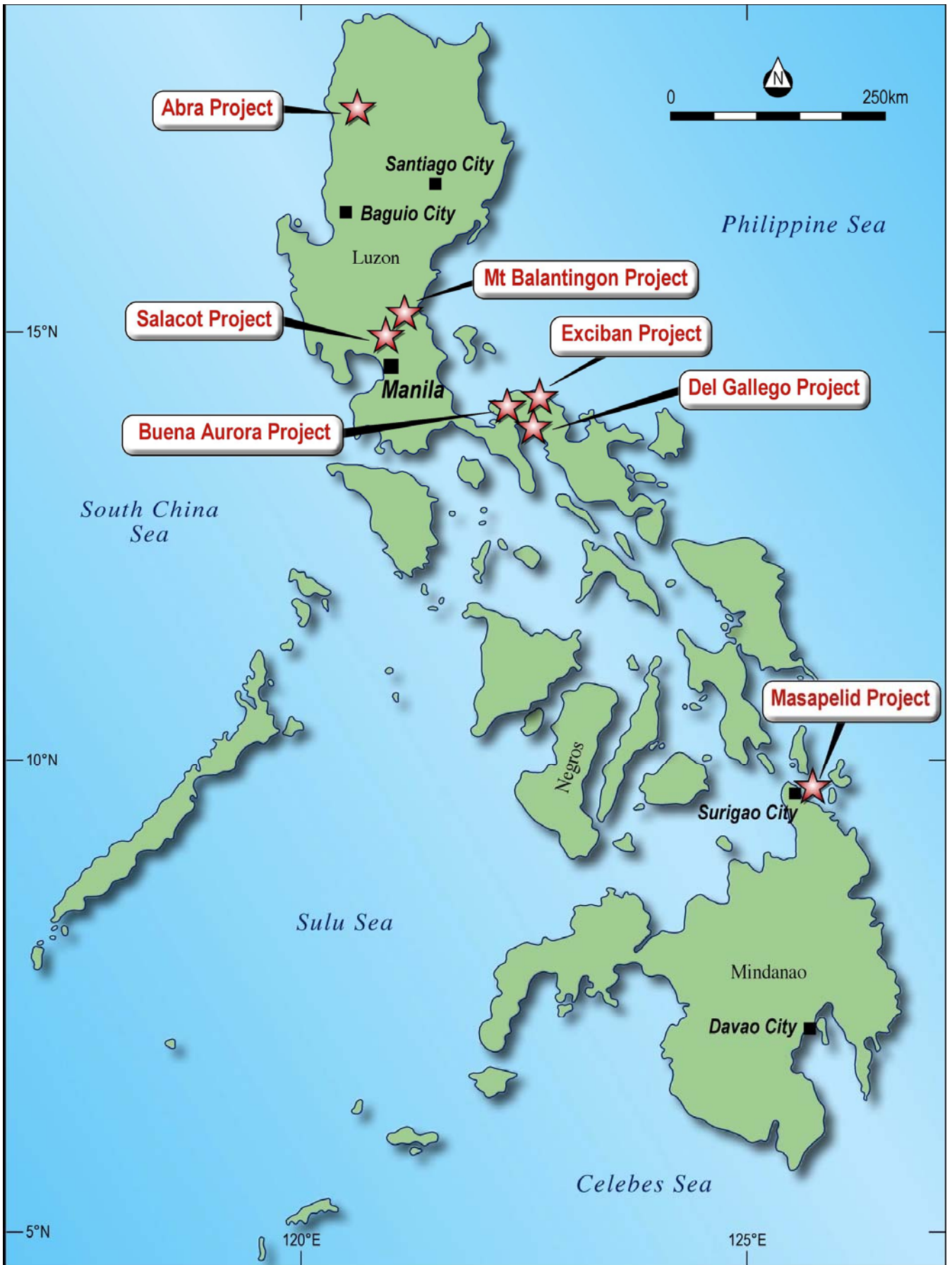
Figure 1: Location of Philippines Projects