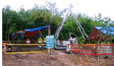
Diamond drill (PQ3) operations at Uyajan.